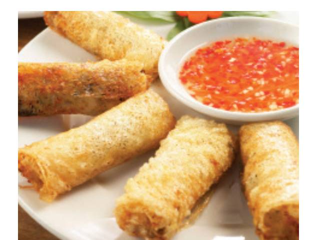
Vegetarian Spring Rolls Served With Sweet Chili Sauce.