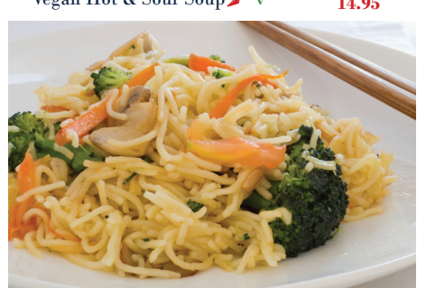
Chicken Chow mein